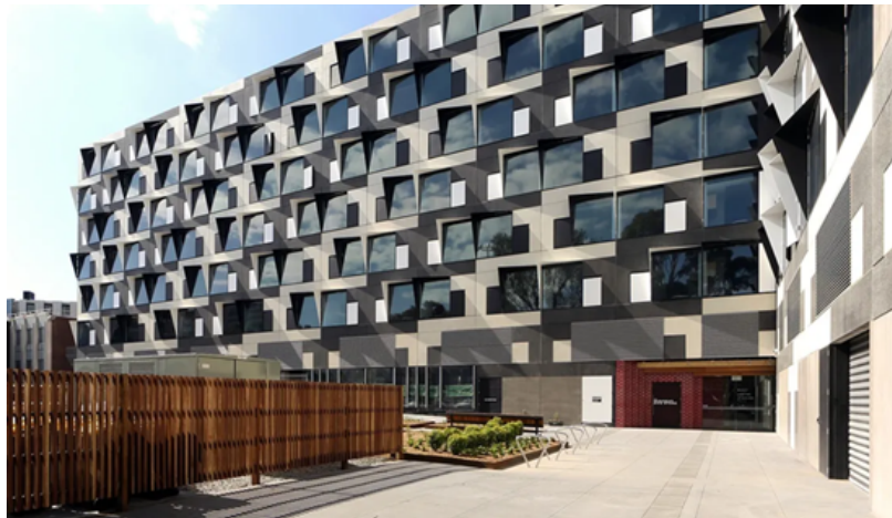
Figure 2. Design Approach